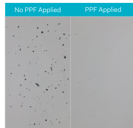
Image represents gravel impact testing on surface paint.